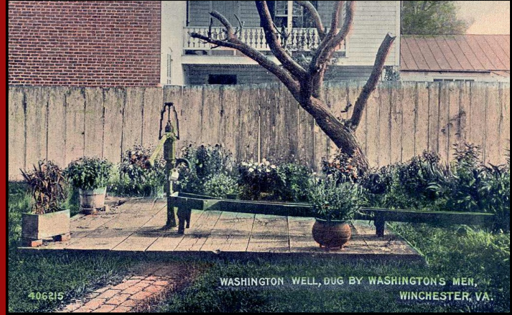
Postcard of Washington's Well c. 1910.